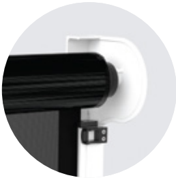
CAST BRACKET WITH BACK FLASHING