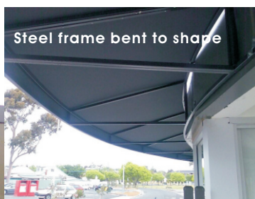
Steel frame bent to shape