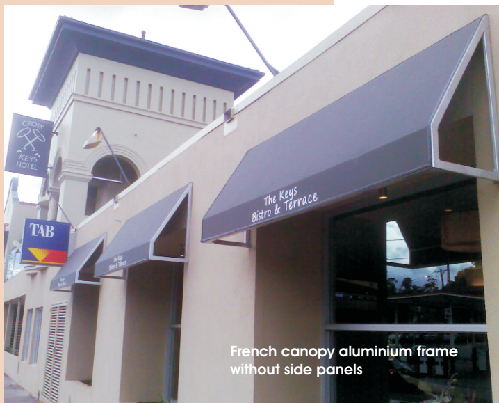
French canopy aluminium frame without side panels

The components used in French Canopy are designed to be long lasting and low maintenance. These items are made from rust-free extruded anodised aluminium and the PVC components contain ultraviolet stabilised polymers.