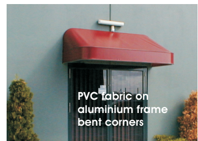
PVC fabric on aluminium frame bent corners