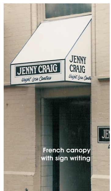
French canopy with sign writing