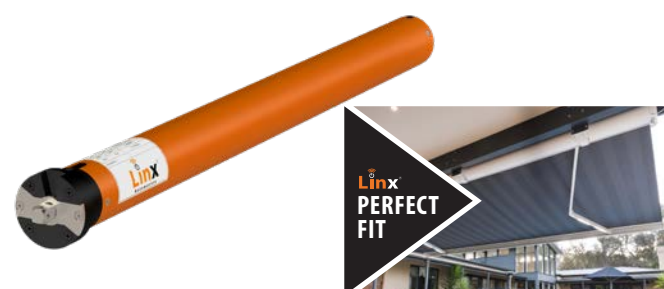
FOLDING ARM AWNINGS (2 ARMS)

FOR ADDED PROTECTION, COMPATIBLE WITH: The Spinner Sun/Wind Sensor and The Shaker Motion Sensor