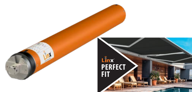
FOLDING ARM AWNINGS (3+ ARMS)

FOR ADDED PROTECTION, COMPATIBLE WITH: The Spinner Sun/Wind Sensor and The Shaker Motion Sensor